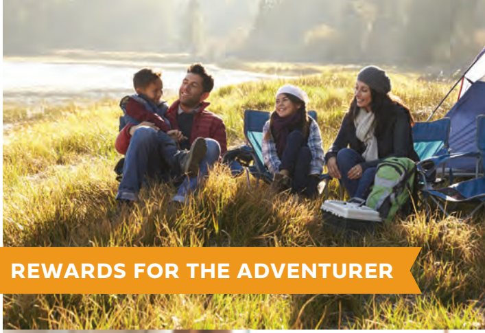
REWARDS FOR THE ADVENTURER

Points = rewards! Choose how you want to treat yourself with the Cornerstone Building Brands Rewards Catalog.