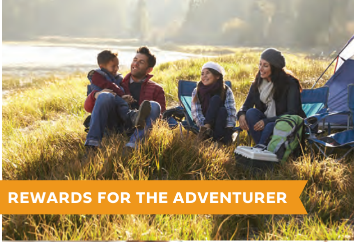
REWARDS FOR THE ADVENTURER

Points = rewards! Choose how you want to treat yourself with the Cornerstone Building Brands Rewards Catalog.