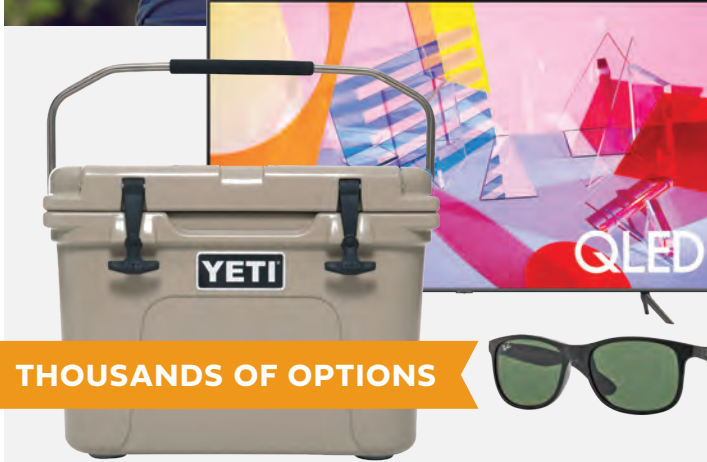
THOUSANDS OF OPTIONS

You can also apply your points to business-building tools including HOVER 3D and Ply Gem Home Design Visualizer. Visit CornerstoneBuildingBrands.com/Rewards for details.