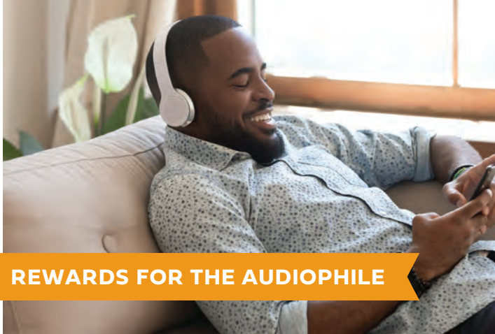
REWARDS FOR THE AUDIOPHILE