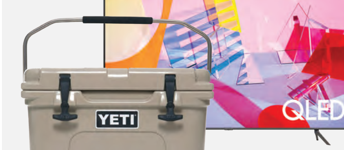
THOUSANDS OF OPTIONS

You can also apply your points to business-building tools including HOVER 3D and Ply Gem Home Design Visualizer. Visit CornerstoneBuildingBrands.com/Rewards for details.