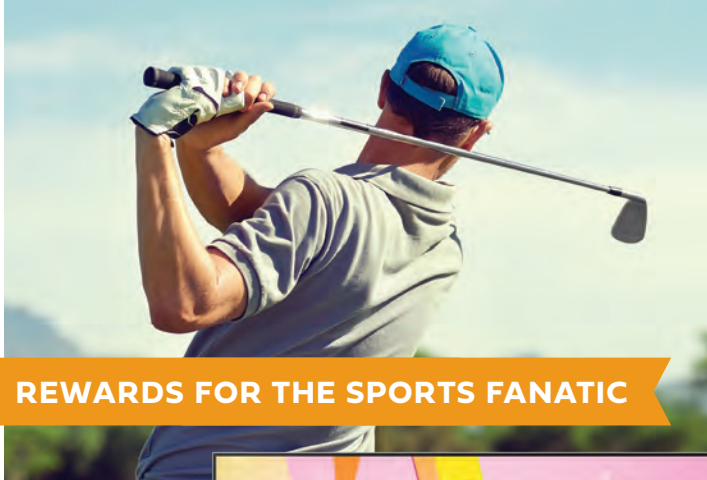
REWARDS FOR THE SPORTS FANATIC